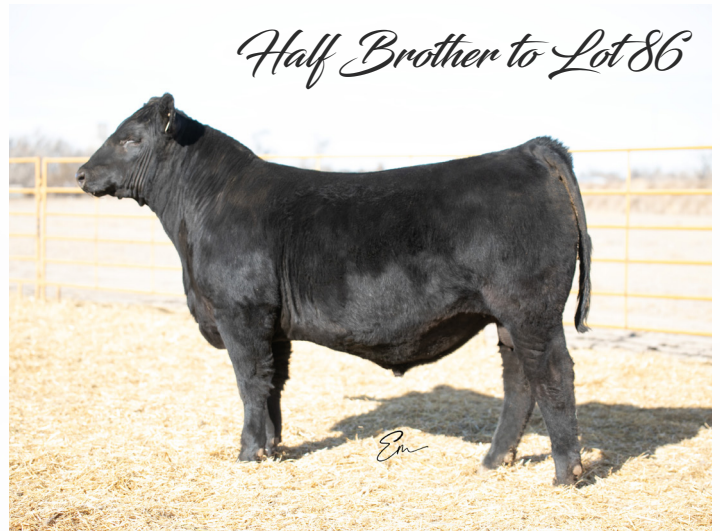
Half Brother to Lot 86

Double Black - Double Polled - 887M is a maternal to our top selling bull in 2023- Kill Shot. 887M is a long bodied, bigger framed bull that ranks in the top 30% of the breed for growth traits and top 45% for FPI.